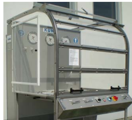
'See Thru' Protection Shutter for KUNZ BTS Brake Test Stand