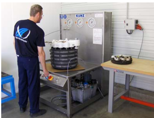
KUNZ BTS-E Brake Test Stand

For Airbus A380 brakes KUNZ has developed the KUNZ BTS-E Brake Test Stand with 7500 PSI. At the Wheel & Brake Shops of Mazeres Aero Equipment (France) and Emirates Airlines (UAE) the BTS is used for the full operational test of Airbus A380 brakes with complete satisfaction (please refer to the Reference Letters below).